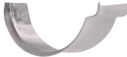
Strip, O/S & I/S