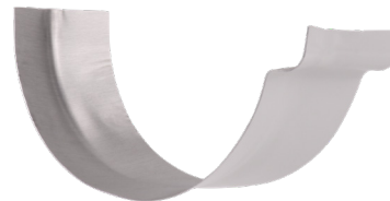
Bay, O/S & I/S