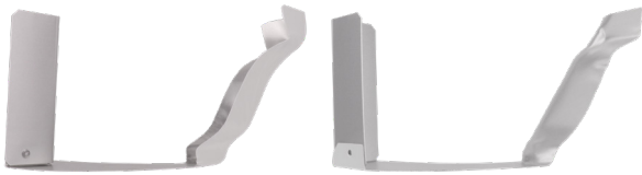
Strip, O/S & I/S