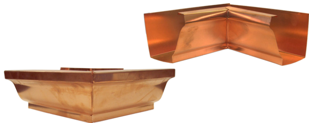
Box, I/S & O/S