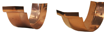
Bay, I/S & O/S