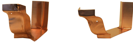
Strip, I/S & O/S